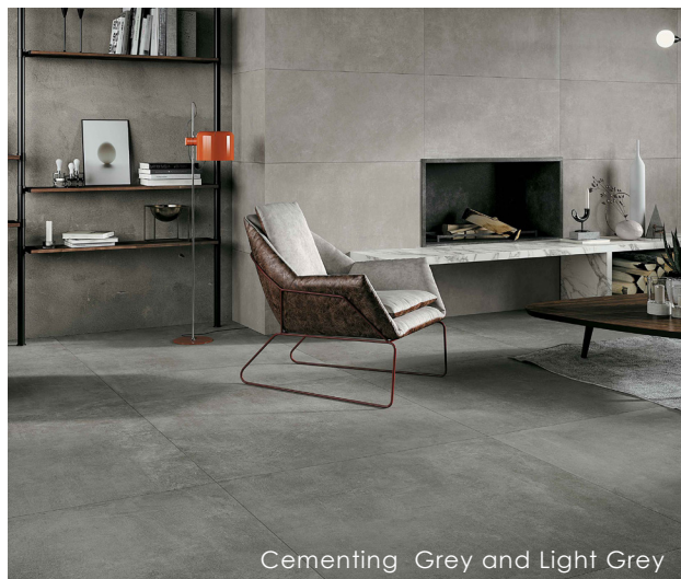
Cementing Grey and Light Grey