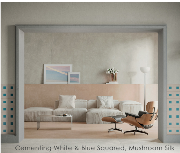
Cementing White & Blue Squared, Mushroom Silk

An Environmental Product Declaration (EPD) is a standardized document that provides detailed information about the environmental impact of a product throughout its lifecycle. It's a key tool in assessing the sustainability of products, especially in sectors like construction and manufacturing. It is a tool for measuring and communicating the environmental performance of a product across its entire lifecycle.