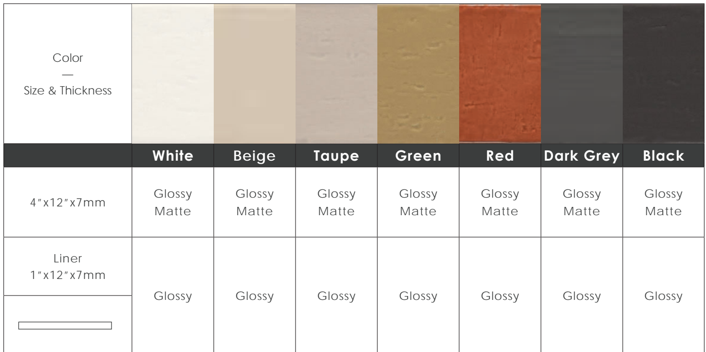
Chart indicates available size, color, finish and thickness options. Shaded block indicates not available. Sizing is nominal for field tile, trims, and decors.