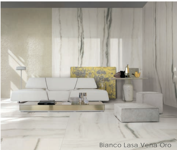
Bianco Lasa Vena Oro

An Environmental Product Declaration (EPD) is a standardized document that provides detailed information about the environmental impact of a product throughout its lifecycle. It's a key tool in assessing the sustainability of products, especially in sectors like construction and manufacturing. It is a tool for measuring and communicating the environmental performance of a product across its entire lifecycle.