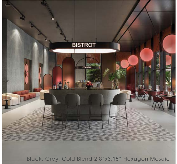
Black, Grey, Cold Blend 2.8"x3.15" Hexagon Mosaic