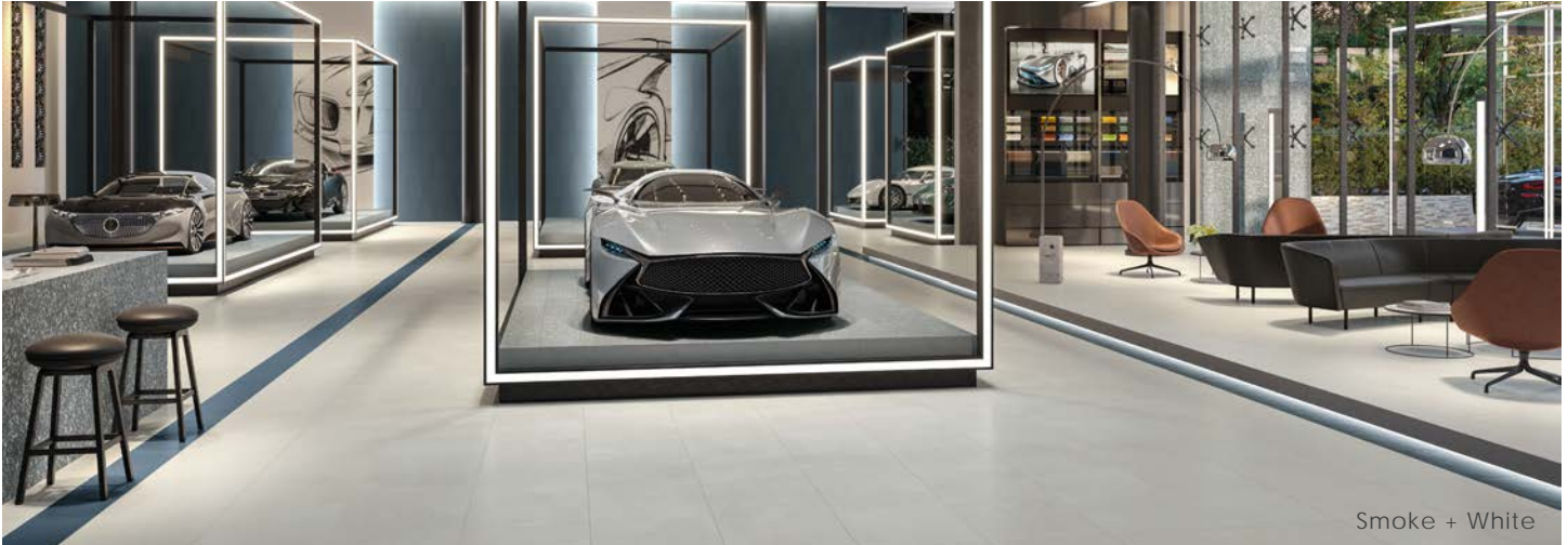
Smoke + White