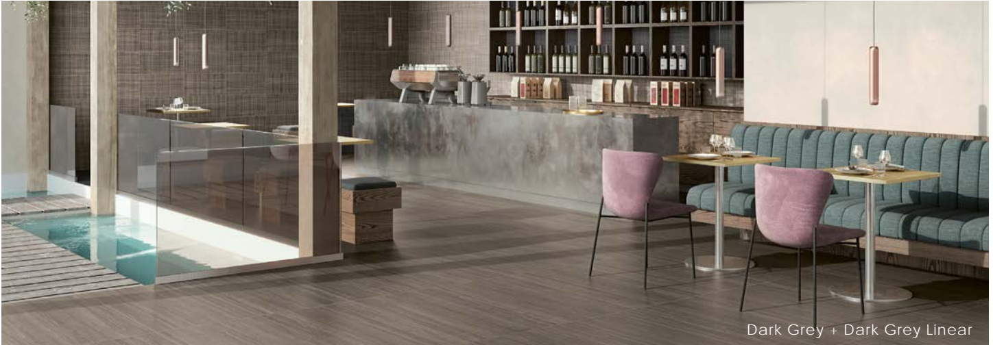
Dark Grey + Dark Grey Linear