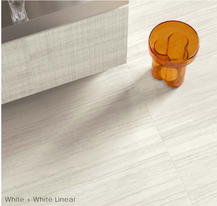
White + White Linear