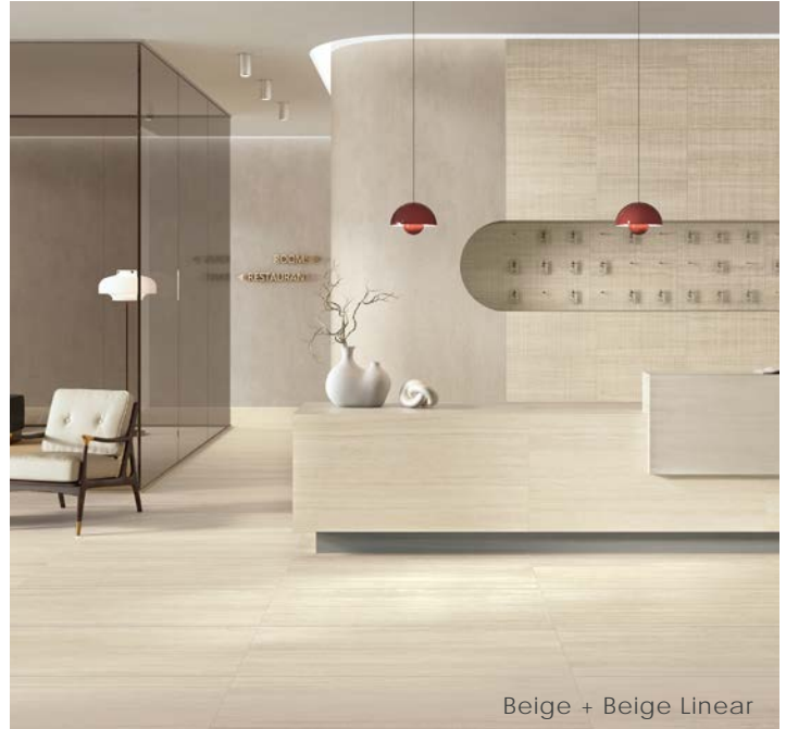
Beige + Beige Linear