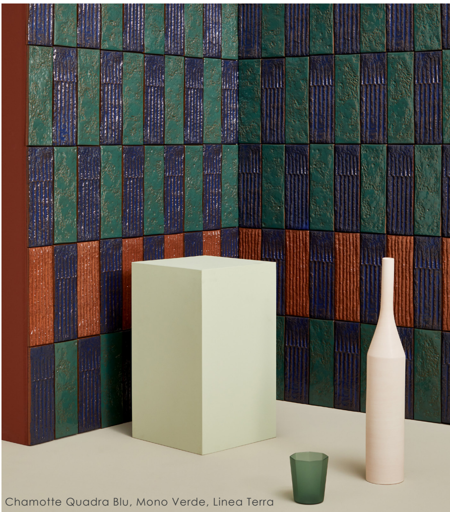
Chamotte Quadra Blu, Mono Verde, Linea Terra

A Health Product Declaration (HPD) is a standardized tool used in the building industry to report the material contents of building products and their health effects. This tool is particularly important for architects, builders, and consumers who are focused on creating healthy, sustainable environments. It provides detailed information about the chemical ingredients in a product and their potential health impacts.