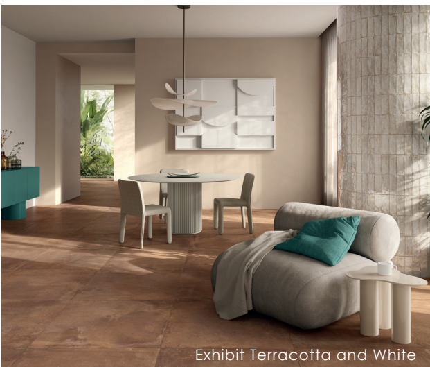
Exhibit Terracotta and White

A Health Product Declaration (HPD) is a standardized tool used in the building industry to report the material contents of building products and their health effects. This tool is particularly important for architects, builders, and consumers who are focused on creating healthy, sustainable environments. It provides detailed information about the chemical ingredients in a product and their potential health impacts.