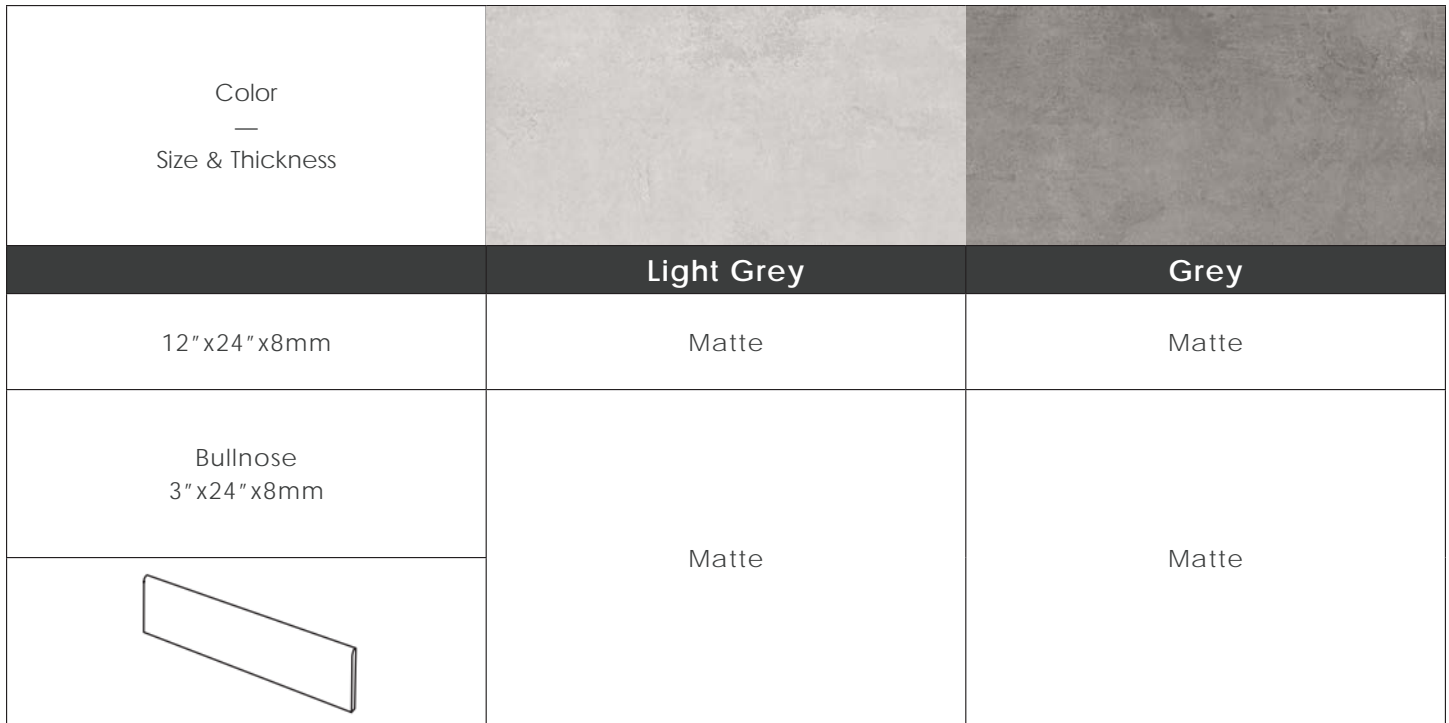
Chart indicates available size, color, finish and thickness options. Shaded block indicates not available. Sizing is nominal for field tile, trims, and decors.