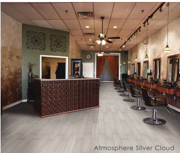
Atmosphere Silver Cloud

Green Squared Certified is a comprehensive, multi-attribute sustainability certification specifically for tiles and tile installation materials. Developed by the Tile Council of North America (TCNA), it's the first standard in the world to assess the environmental and social impact of ceramic tiles, glass tiles, and tile installation materials. It's not just focused on one aspect of sustainability, but rather encompasses a variety of factors including product manufacturing, long-term value, corporate governance, and innovation.