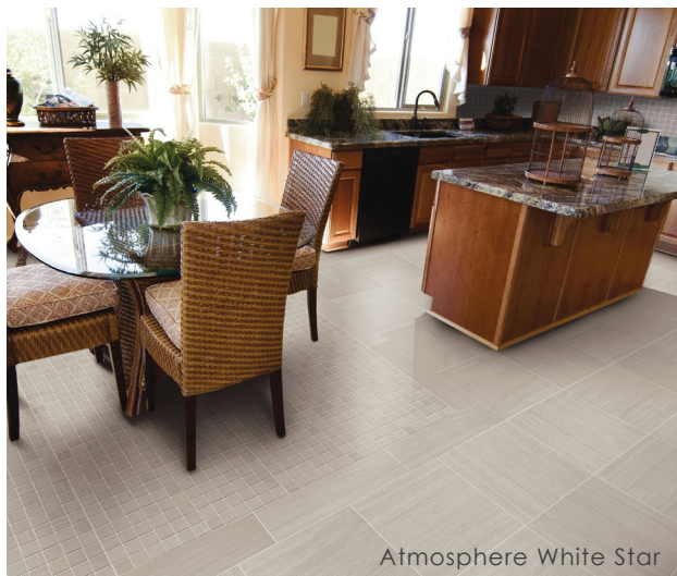
Atmosphere White Star