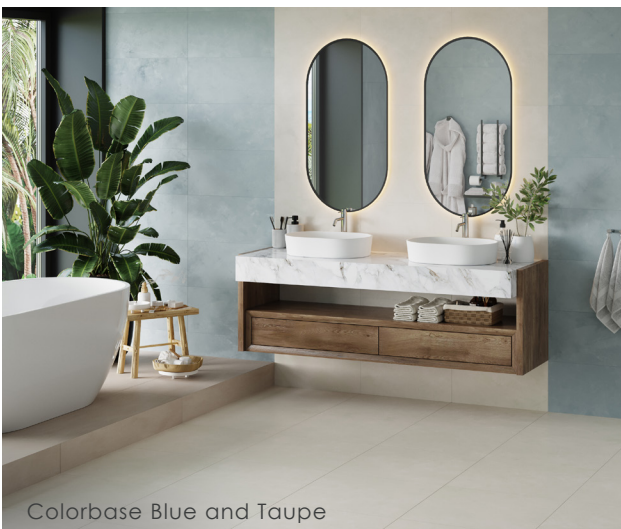
Colorbase Blue and Taupe

An Environmental Product Declaration (EPD) is a standardized document that provides detailed information about the environmental impact of a product throughout its lifecycle. It's a key tool in assessing the sustainability of products, especially in sectors like construction and manufacturing. It is a tool for measuring and communicating the environmental performance of a product across its entire lifecycle.