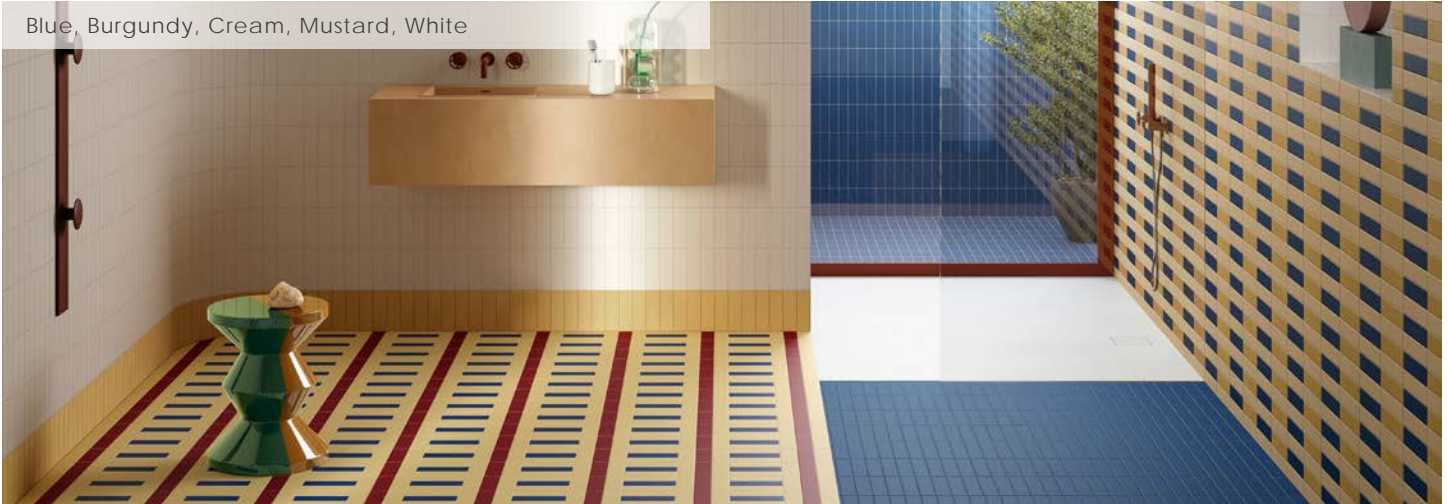
Blue, Burgundy, Cream, Mustard, White