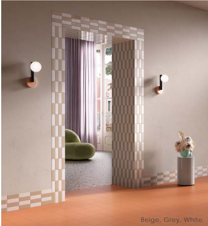
Beige, Grey, White