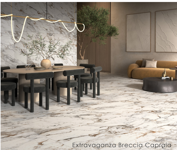
Extravaganza Breccia Capraia

The Declare Label - Red List Free Declare Label, is a transparency tool and eco-label in the building industry. It focuses on promoting the use of materials that are free from harmful chemicals and toxins. Products that achieve "Red List Free" status do not contain any of the chemicals or elements listed on the International Living Future Institute's (ILFI) Red List. These include items, such as asbestos, known to pose serious health risks.