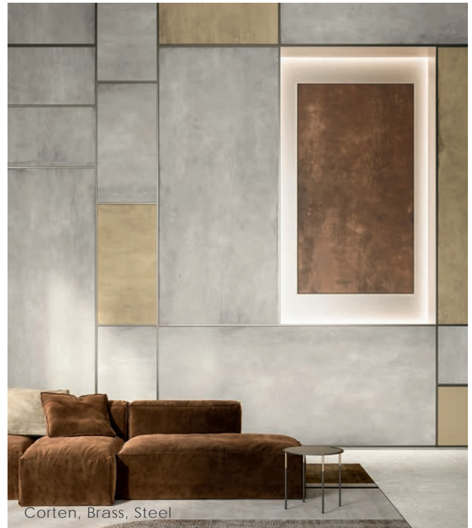
Corten, Brass, Steel