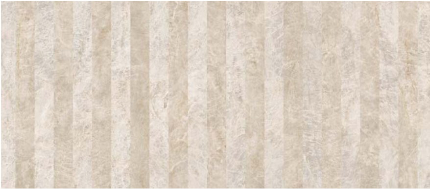
Ivory and Taupe Linear 48" x 110" x 6mm Ultra Polished Rectified