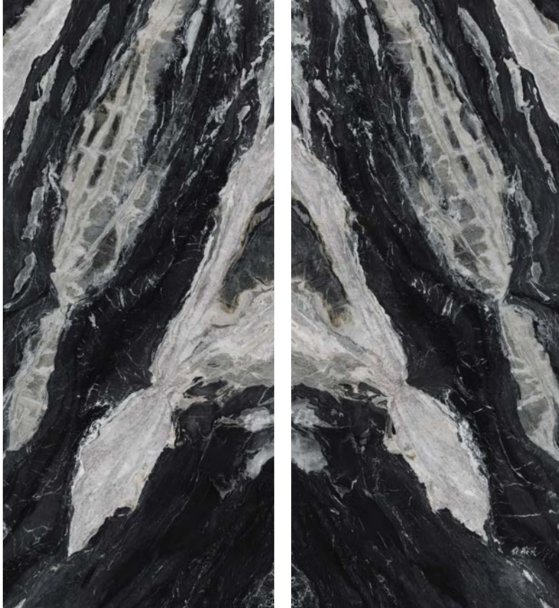
Bianco Dior Bookmatch