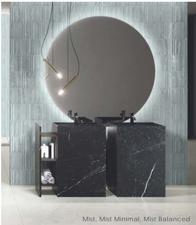
Mist, Mist Minimal, Mist Balanced

A Health Product Declaration (HPD) is a standardized tool used in the building industry to report the material contents of building products and their health effects. This tool is particularly important for architects, builders, and consumers who are focused on creating healthy, sustainable environments. It provides detailed information about the chemical ingredients in a product and their potential health impacts.